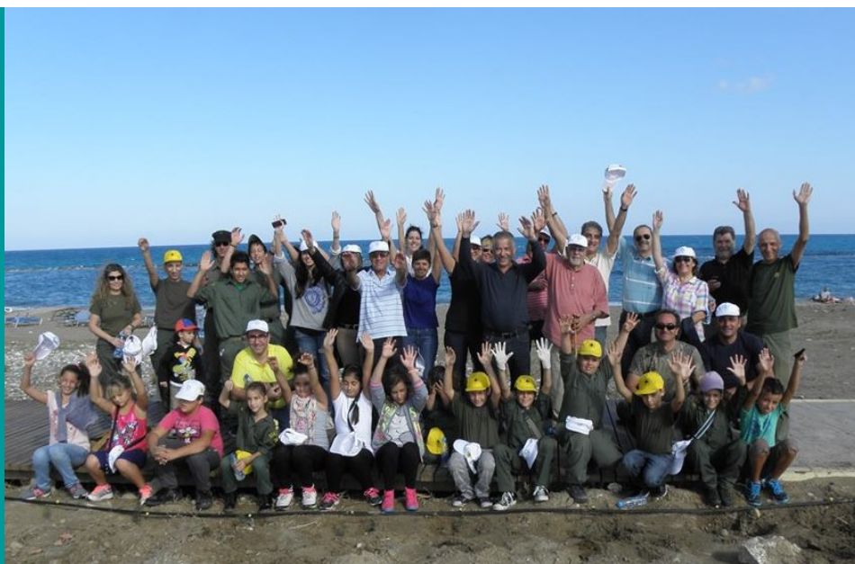
Tree planting in Polis Chrysochou beach-Greening Cyprus Beaches Project

Do you manage a beach hotel and do you want to be pioneer in the tourism industry? Find out more about the Greening project and implement the green initiatives easily and sustainably!