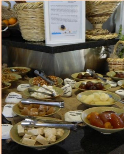
A perfect display of local products using local ceramics and traditional handicrafts at LOUIS KING JASON