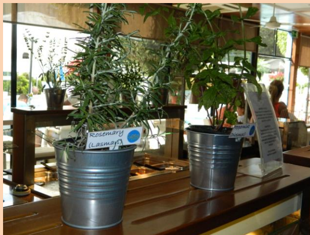
A display of fresh Cyprus herbs, gives breakfast an authentic scent at Anemi Hotel