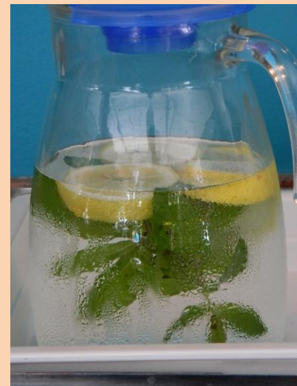
Water with Fresh Cyprus Mint with lemon at Anemi Hotel