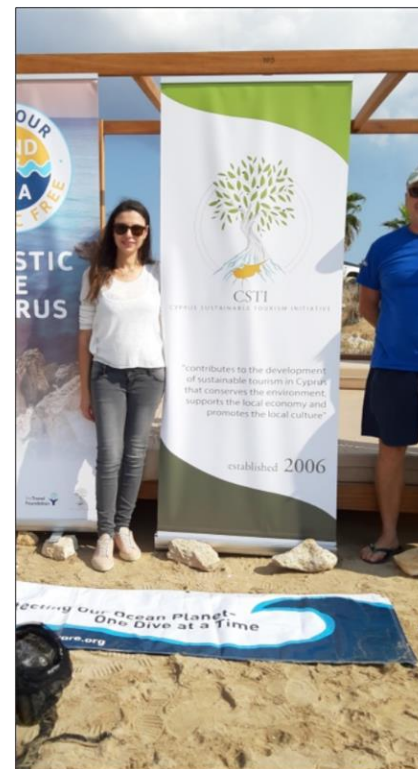
Sea clean-up with the Ocean View Diving Cyprus team 29 October 2019