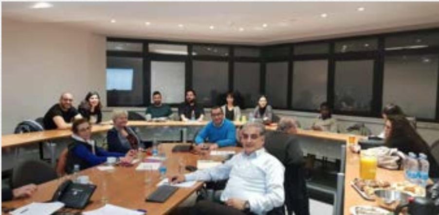
The University of Nicosia