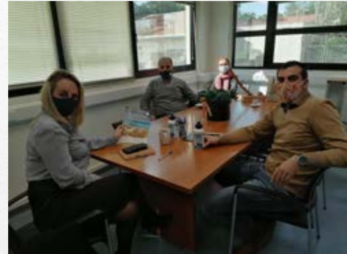
The Commissioner of the Environment