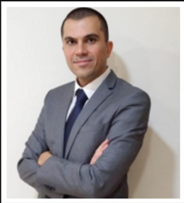
Mr. Savvas Perdios Deputy Minister of Tourism of the Republic of Cyprus