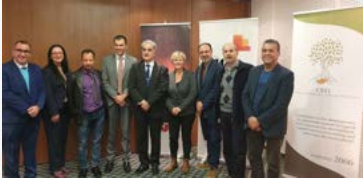
The Deputy Minister of Tourism

Ongoing Cooperation with these & many more!